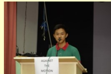
THE DEBATE CONTINUES....