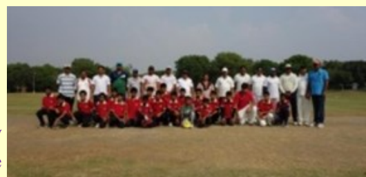
THE TWO TEAMS