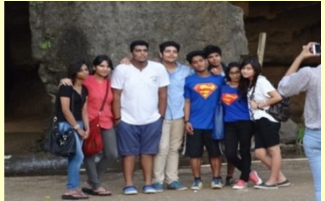
SOLID ROCK FRIENDSHIPS