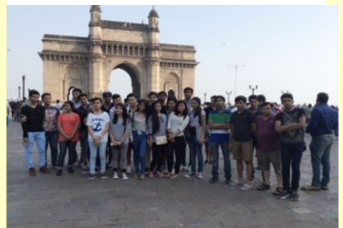
GATEWAY TO PLEASURE