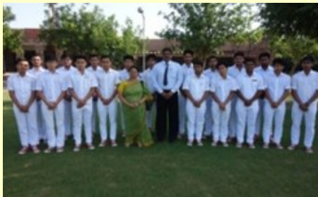
AND THE NATIONALS....