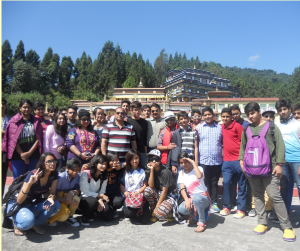
FEELING DIVINE AT RUNGTAC MONASTRY

“We just couldn't get enough of what all we were going to do! Special memories! The sight-seeing, shopping, food and hotels- all awesome! The real happiness lay in bathing in not so hot water late nights and early mornings, looking for ‘Momos’ and cup noodles to keep ourselves warm, listening about famous ghosts who lived in the hills, and getting to meet new people everywhere. Amidst the beautiful scenery, it was a perfect way to release our cortisol and get rejuvenated.