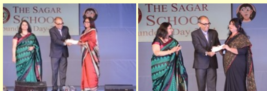
AWARDS OF EXCELLENCE