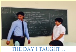
THE DAY I TAUGHT...

Teachers were treated to generous doses of love, affection, fun, entertainment and tongue tickling delicacies and beautifully crafted handmade individual cards. The class 12 th students enthusiastically marched into the academic classes from 4 th to 11 th equipped with chalk, duster and teaching ideas.