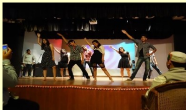
ROCK THE STAGE