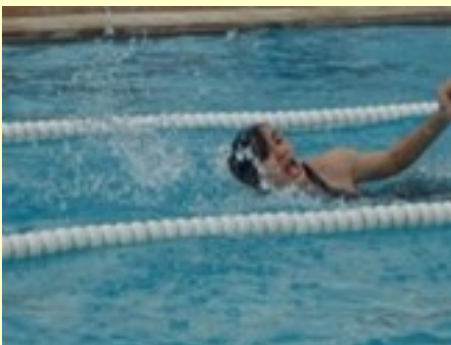
SWIM TO VICTORY

Ruby- First, Diamond – Second, Emerald - Third and Sapphire- Fourth