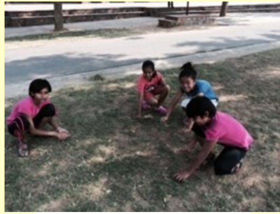
The Safai Abhiyaan...