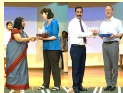
UNITY WITH A VISION