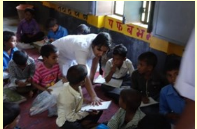
At MALIYAR GUJJAR

The IAYP volunteers helped to sensitise the local community by organising a slogan writing competition in the neighbouring primary school at Maliyar village. The children were also provided with a drawing kit. Prizes were awarded to three winners from each group.