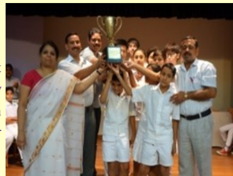
AND THE CUP THAT CHEERS