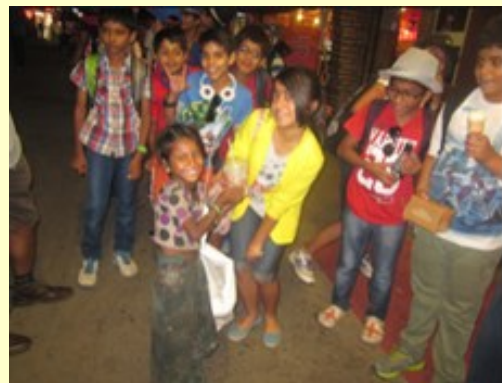
WORLD SMILE DAY, 3 RD OCTOBER