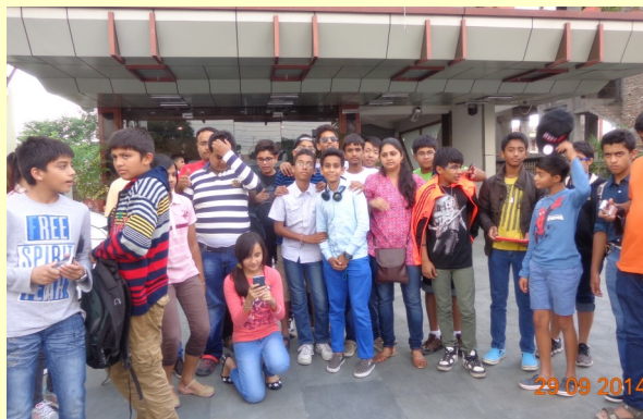
WHAT A TRIP IT WAS!!!