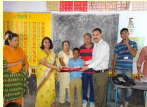
LITERACY IS IMPORTANT