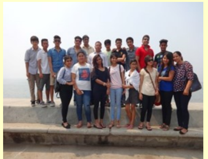
SEA OF TOGETHERNESS