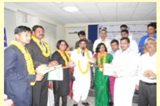
HALLS OF FAME