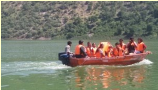
FUN AT SILISERH along with the VICE PRINCIPAL