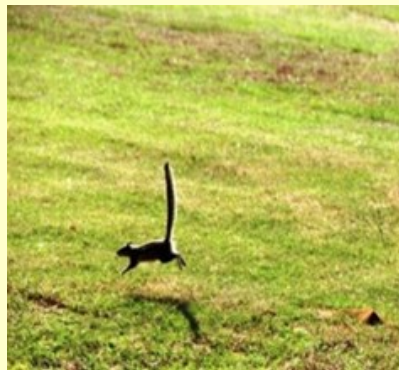
Scurrying to safety

Third Position: Dikanshit Lamba, Emerald House, class IX