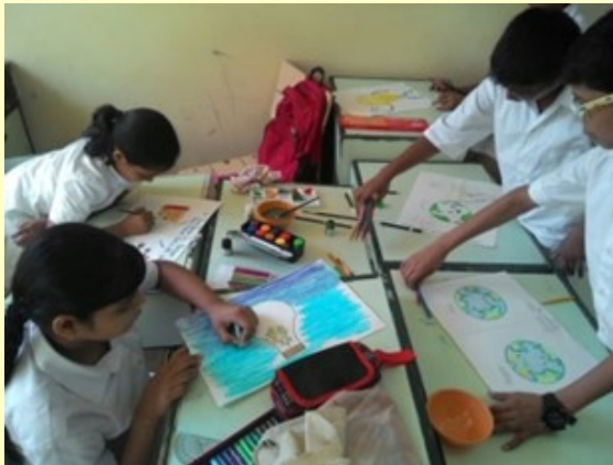
Save Energy, Secure your future