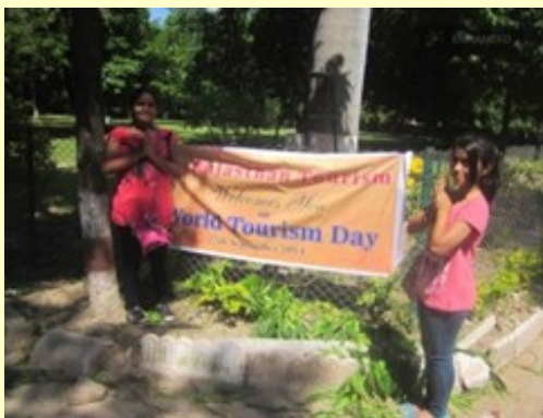
27 TH SEPTEMBER, DURING RAJASTHAN TRIP

International Tourism Day AND World Smile Days were observed by the students during RAJASTHAN trip.