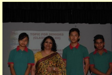
GIFT OF THE GAB...WINS....