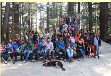
Hidimba Devi Temple, Manali

Students of class IX visited memorable spots that were: