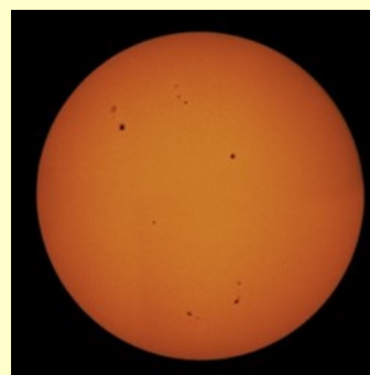
Clicked through the Sagar School Telescope

The exhibits displayed at the observatory building were well received by the visitors and parents. A short movie (8 minutes) was screened continuously in the Astronomy